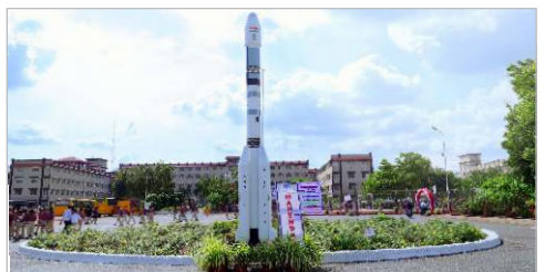
ISRO Space Expo 2022 @ Mahendra