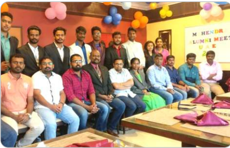
Alumni Meet at Sharjah, UAE on 23.11.2018

Mahendra Alumni Team of 1995 - 1999 batch initiated MAHENDRA ALUMNI SCHOLARSHIP SCHEME (MASS) for meritorious students. Eligible students from various branches were given scholarship to the tune of Rs.2,00,000 for pursuing their education. Awareness programmes about the latest development and trends in technology, scope for higher education and the industry requirements are conducted by the Alumni through Mahendra Alumni Inter-Lecture Series (MAILS) periodically.