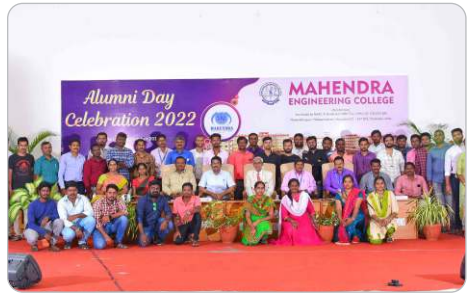
A day with Alumni in the Campus on 24 th September 2022