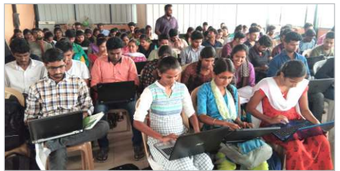
On Campus & Bangalore Training Centers