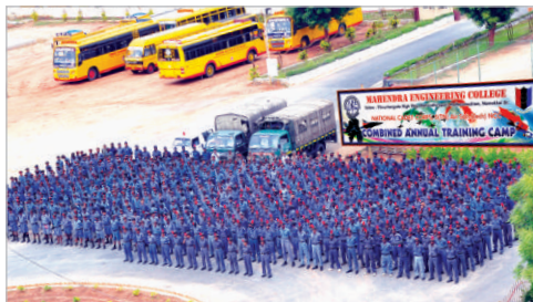
NCC Annual Training Camp