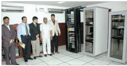
Hi-tech Data Centre