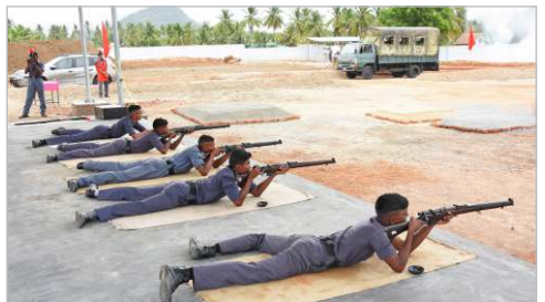
Combined Annual Training Camp