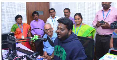
Mahendra FM 90.4 Community Radio