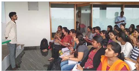
On Campus & Bangalore Training Centers