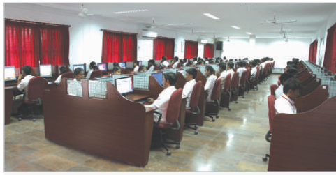
Training on Embedded Systems